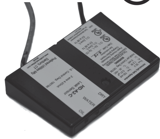
HD-A2-C Leak Detector Transmitter