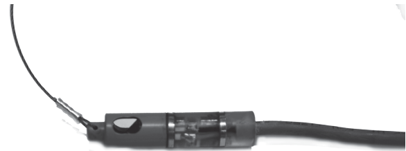
HD-A2-C Leak Detector Probe and Pull Cable